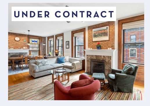
311 WEST 97TH ST #7E 3 beds | 1.5 baths Listed for $1,300,000

34 WEST 89TH ST 6 beds | 7 full & 2 Half baths Listed for $6,999,999