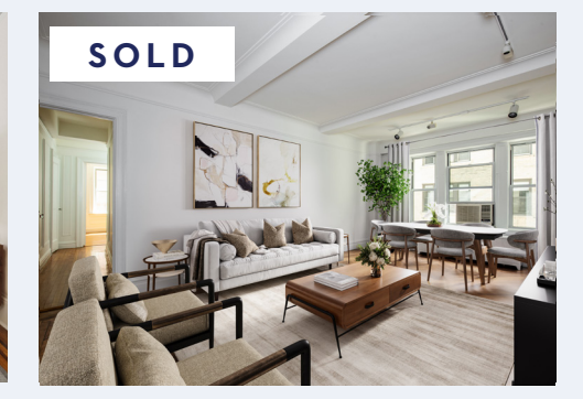
250 WEST 94TH ST #4F 2 beds | 1.5 baths Sold for $1,100,000

110 WEST 90TH ST #GA 2 beds | 2 baths Listed for $1,375,000