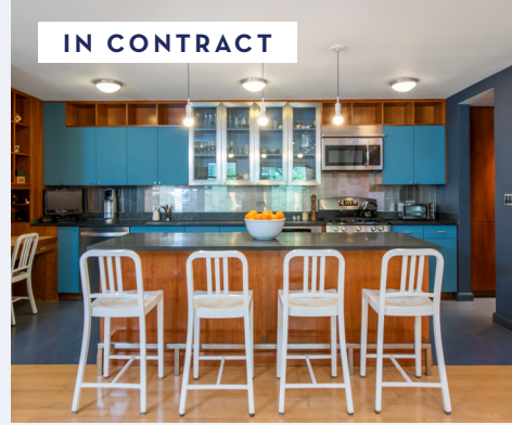
110 W 90TH ST #3C3E 4 Beds | 3 Baths Listed for $2,650,000