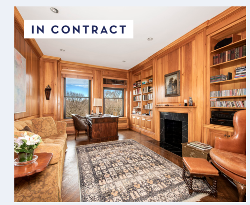
1040 FIFTH AVE #7/8B 10 Rooms | 4.5 Baths Listed for $7,995,000