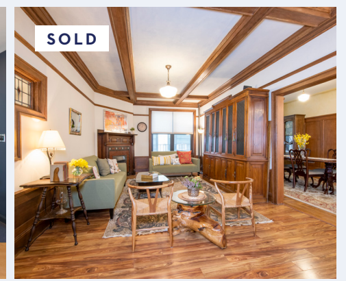
545 W 111TH ST #6FG 3 Beds | 2 Baths Sold for $1,717,500