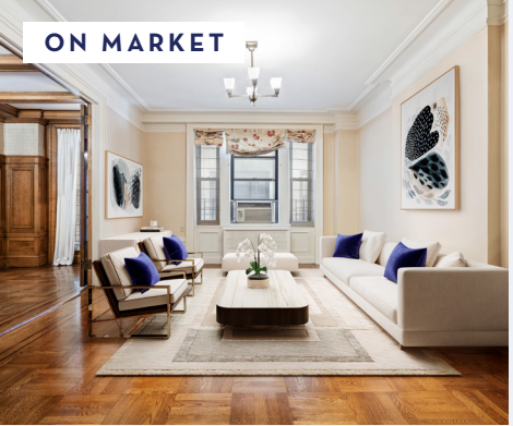
645 WEST END AVE #4C 2 Beds | 2 Baths | Listed for $2,250,000 3 Beds | 2.5 Baths | Listed for $2,095,000 2 Beds | 2 Baths | Listed for $1,850,000